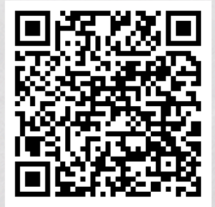
SCAN TO LISTEN

THE SONG'S STORY BEHIND THE SONG SHARES PERSONAL EXPERIENCES OF ANXIETY AND FEELING INADEQUATE, AND HOW THE SONG BECAME A DECLARATION OF FAITH AND RELIANCE ON GOD DURING DIFFICULT TIMES