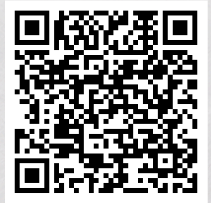
SCAN TO LISTEN

PURPOSE: HE SONG IS MEANT TO BE A PROPHETIC SONG FOR THOSE WHO HAVE BEEN SOWING, PRAYING, AND WAITING ON GOD, INSPIRING HOPE AND CONFIDENCE IN HIS POWER.