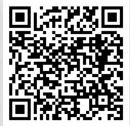
SCAN TO LISTEN

GOD'S PERFECT TIMING: THE SONG REMINDS LISTENERS THAT GOD IS AN "ON TIME GOD," MEANING THAT HE ALWAYS SHOWS UP WHEN HE IS NEEDED, AND THAT HIS TIMING IS ALWAYS PERFECT.