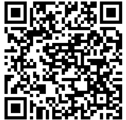
SCAN TO LISTEN